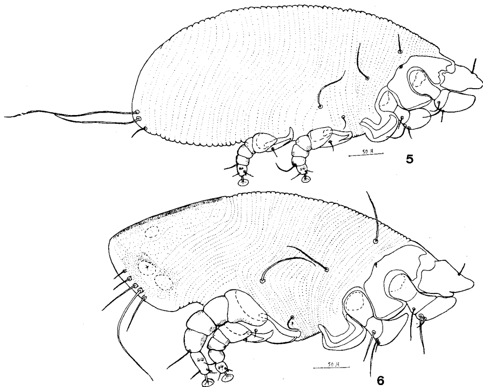
FIG. 5. Schizocarpus mingaudi Trouessart, lateral view of female.